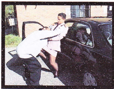
Defence from a car