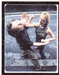
Defence on the street