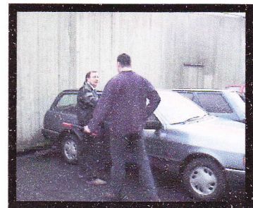
Defence in a Parking lot