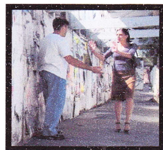
Defence in an alleyway