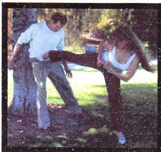
Defence in a park